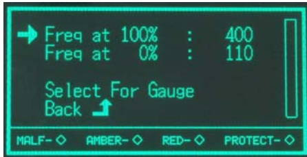
Figure 24. Frequency Throttle Setup

The Frequency throttle sends a 50% duty cycle frequency signal to the engine control module. The Enable switch must be toggled up for this throttle to operate, see Figure 20. To adjust the Frequency Throttle options, move the Arrow on the display to Remote Throttle and press “ENT” button. See Figure 24.