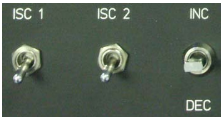
Figure 18. ISC Switches

ISC – The ISC switches allow the user to select an alternate speed if the engine controller supports this feature. See Figure 18.