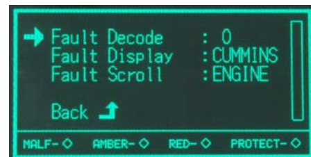
Figure 9. Fault Options

Fault Scroll – Selects what source the fault codes are received and displayed from in the fault window. The options here are from the Engine or Transmission. Once the user selects which source they would like the faults to come from, the main screen will update stating the location. See Figure 7.