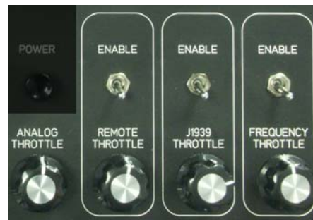
Figure 20. Throttle Interface

To setup the options for these throttles, see Portable Test Cell Throttle setup section.