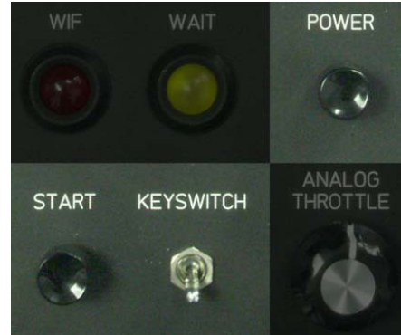
Figure 19. Start/Key/Power Switches

Power – Controls the power of the Portable Test Cell unit and also the engine control unit that it is connected to. The Power button will turn the power on for the Portable Test Cell unit. Press and hold this button for one second to turn the unit on. The Keyswitch will turn On/Off the key input for the engine control unit. The Start button engages the starter solenoid. See Figure 19.