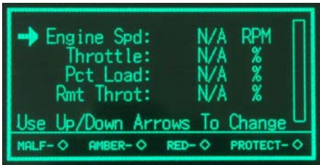
Figure 15. Changing Parameters

The parameters can be changed by moving the arrow to the location that needs to be changed. Once the arrow is pointing to the location that needs to be changed, press the "ENT" key and then use the Up/Down arrows to pick the parameter. When the parameter that needs to be displayed is listed, simply press the "ENT" key again to set it. As the parameter name changes, the value will automatically update. If that parameter is not currently being broadcast then the symbol N/A will be displayed. Figure 15 displays what the screen looks like when the user is changing parameters.