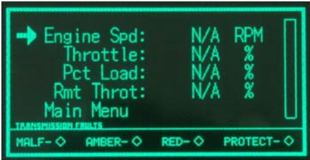
Figure 14. Parameter Screen

Selecting this option from the menu will display the parameter screen. The four parameters are displayed on the screen.