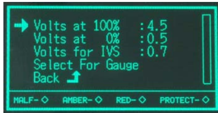
Figure 21. Analog Throttle Setup

The Analog throttle simulates a throttle pedal that would be mounted inside a vehicle cab. There are two associated switches that get activated by this throttle. The two switches are for Idle Validation. The two switches will change from an On to Off state and they are opposite from each other. To adjust the Analog throttle options, move the Arrow on the display to Analog Throttle and press "ENT" button. See Figure 21.