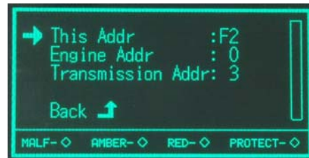
Figure 4: Address Setup Menu Example

To change a value or adjust a menu item, select the item by pressing the Up and Down arrow keys and then press "ENT". The menu will appear for that item. For example, pressing the "ENT" key while the arrow is on "This Addr" will display the options for that feature. The following figure depicts this example: