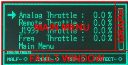
Figure 1. Main Display Window

The main display is sectioned off into three areas. Main menu, Fault window, and Bar Graph Gauge window.