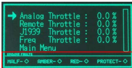
Figure 6. Fault Window

The fault window can be seen in Figure 6.