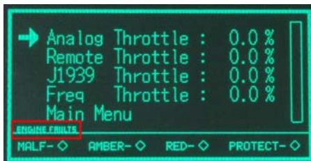
Figure 7. Fault Source for Engine

The faults that are being collected and displayed will be from the engine or transmission. The user can determine this by the text above the Fault window. See figure 7 and 8.