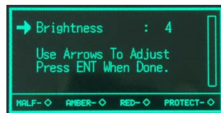
Figure 13. Set Brightness

There are four different settings of brightness for the display. The default value is 4 and it's the maximum brightness.