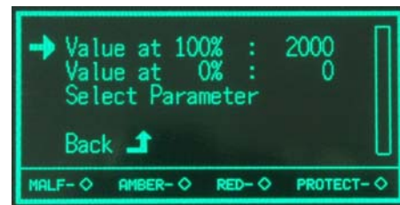
Figure 12. Setup Gauge Options

Setup Gauge – Allows the user to setup the bar graph on the Main Display. The high and low limit can be adjusted along with selecting which parameter uses the bar graph. Figure 12 shows this menu.