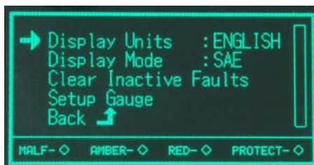
Figure 11. Other Options

The options that are shown in Figure 11 are: