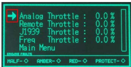
Figure 3: Navigation Arrow

By Pressing the Up or Down key, the arrow located on the left side of the display will move in that direction.