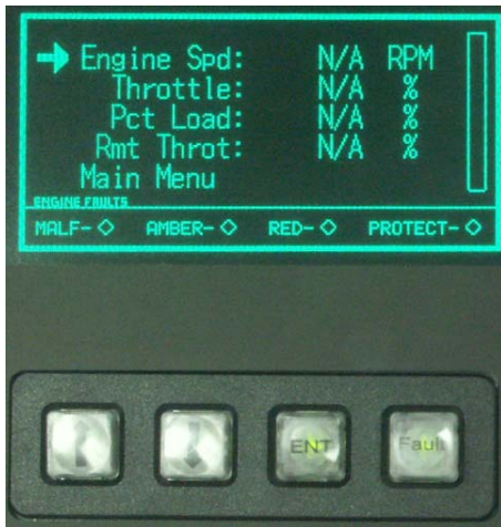
Figure 16. Display Interface

Display – Allows viewing of datalink parameters and allows the user to setup the unit. Includes the four button keypad below the display. See Figure 16.