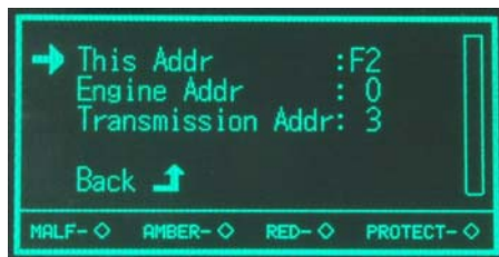
Figure 10. Address Options

Transmission Addr – Sets the datalink address for the transmission controller. Typically, transmissions have an address of "3".