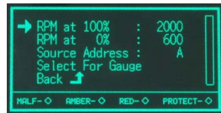
Figure 23. J1939 Throttle Setup

The J1939 is a datalink throttle that sends the appropriate messages to the engine controller. The knob position is converted into data that is periodically transmitted. The Enable switch must be toggled up for this throttle to operate, see Figure 20. There are no associated Idle Validation switches with this throttle. To adjust the J1939 throttle options, move the Arrow on the display to Remote Throttle and press "ENT" button. See Figure 23.