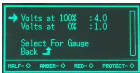
Figure 22. Remote Throttle Setup

The Remote throttle simulates a remote throttle pedal that would be used outside of a vehicle cab. The Enable switch must be toggled up for this throttle to operate, see Figure 20. There are no associated Idle Validation switches with this throttle. To adjust the Remote throttle options, move the Arrow on the display to Remote Throttle and press "ENT" button. See Figure 22.