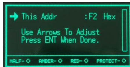
Figure 5. Options Menu Adjustment Screen

Once the options menu is displayed, as shown in Figure 4, select the item that you want to adjust and press "ENT" again. This will display the menu where the parameter can be adjusted. For example, press "ENT" while the arrow is pointing to "This Addr" to adjust the datalink address for the unit, see Figure 5.